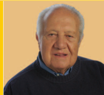
Mario Soares PORTUGAL POLITICS