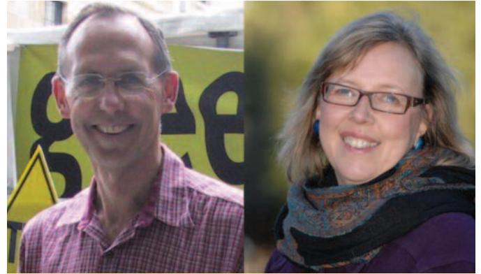
Bob Brown and Elizabeth May

Bob Brown , leader of the Australian Greens, on the 6th of May sent this message to organisers in Australia: "I endorse the World March for Peace and Nonviolence. We could begin by diverting some of the billions of dollars being spent globally on armaments annually to the billion people living in poverty. Congratulations to everyone who