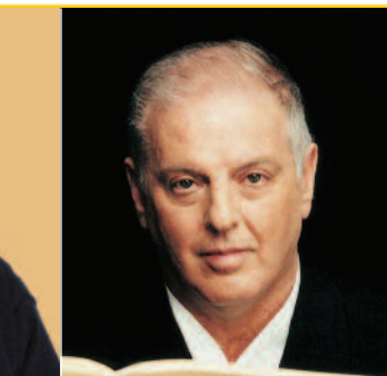
Daniel Barenboim GERMANY MUSIC