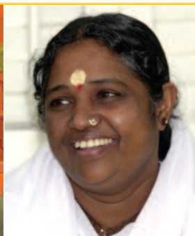
Amma INDIA RELIGIOUS & SPIRITUAL

Founder of the Iraqi Academy of Art. "As a Kurdish Artist I have confronted a lot with violence. Somebody who is not able to love will end up hating. It's a matter of human responsibility not to close one's eyes to poverty, war, exploitation and injustice."