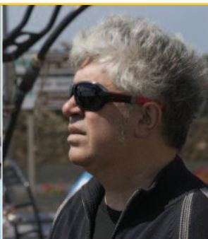
Pedro Almodovar SPAIN TV-CINEMA-THEATRE